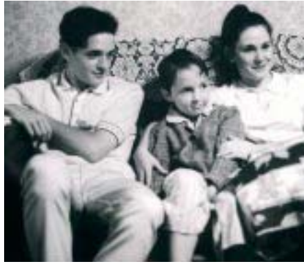
“The Boy from Mercury” (images courtesy of Irish Film Archive and Venus Productions).